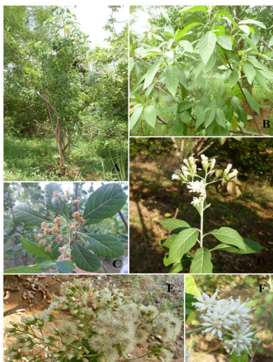
Figure: 1. Gymnanthemum amygdalinum . A. Habit. B. Branch. C-D. Flowering twigs. E- F. Inflorescence.

puberulent beneath. Receptacle 2 x 2 mm, flat, foveolate, brown. Florets 16-17 in each capitulum, up to 2 cm long. Corolla creamy-white, 7- 8.5 x 1-1.2 mm, tubular, 5-lobed; lobes 3 x 0.8 mm, rounded at apex. Stamens 5, 5 mm long; filaments glabrous, 2 mm long; anthers 3 x 0.2 mm, sagittate at base, rounded to subacute at apex. Gynoecium 10.5 mm long; ovary 1.5-1.8 x 0.2-0.4 mm, hairy; style 5 mm long, glabrous at base, hairy at apex; stigma subulate, unequal, 3-3.5 mm long, hairy. Achenes 3 mm long, oblong, slightly cuneate at base, 10-ribbed, glandular between the ribs, numerous spreading hairs on the ribs; pappus in 2-series of bristles, white, persistent, outer ones few, c. 2 mm long, inner ones c. 7 mm long.